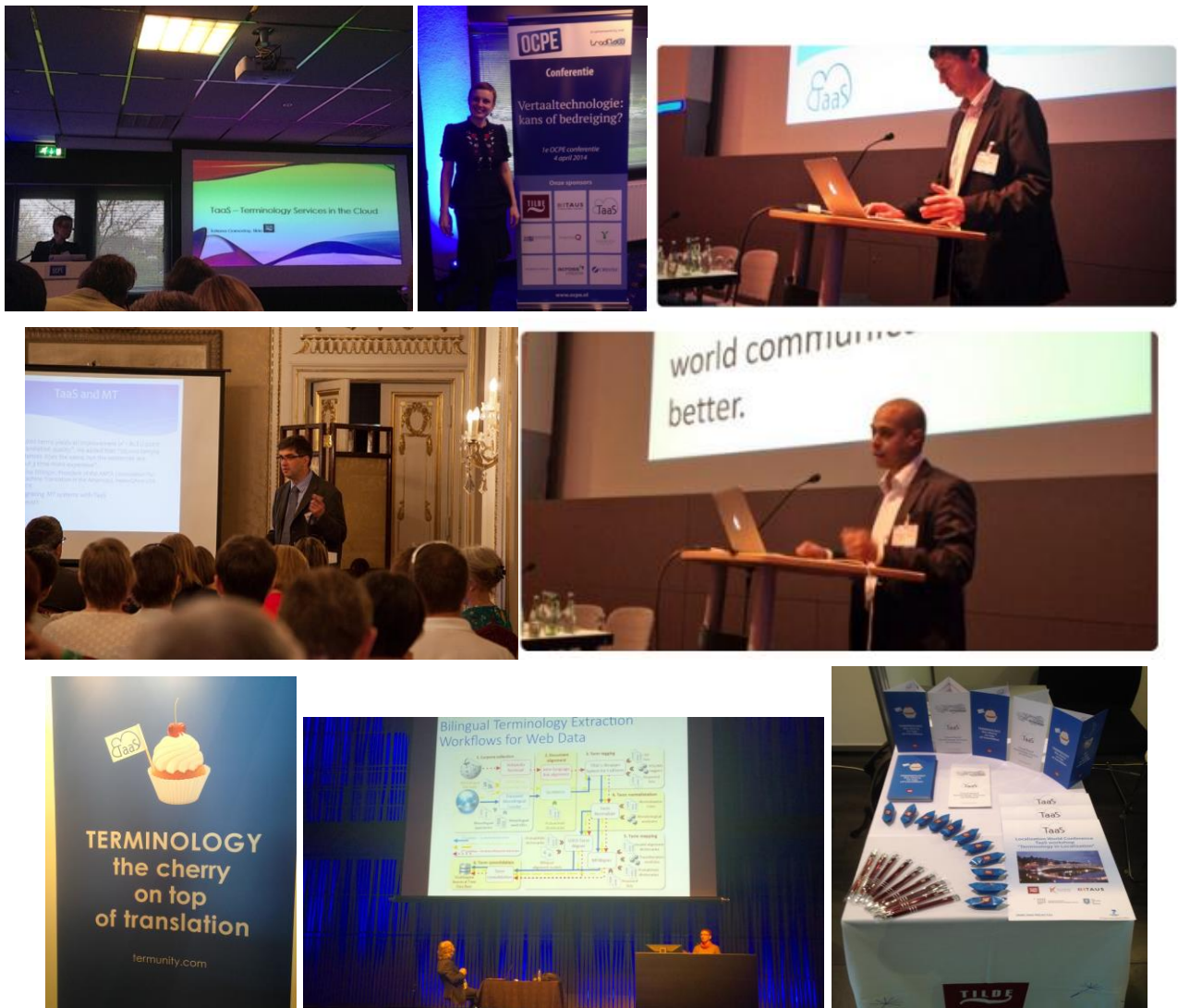
Figure 1a. Example photos of TaaS at business and academic events during Year 2