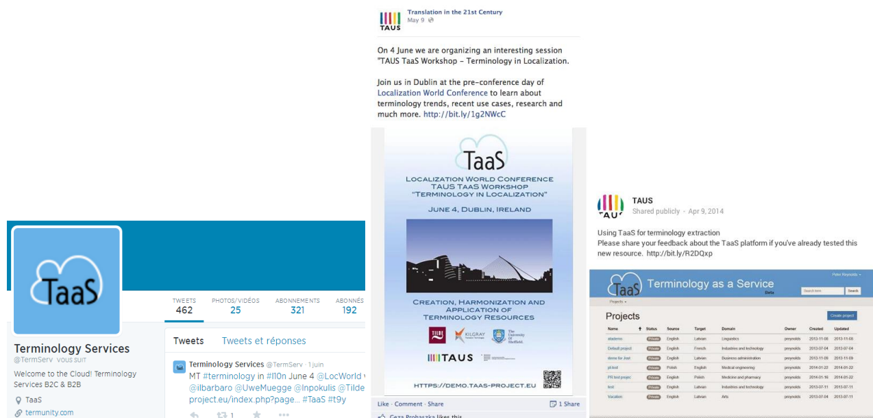
Figure 2. Example activities of TaaS on social media

We developed introductory video demonstrating main functionalities of the first public release of open Beta testing and published it on the TaaS platform website and on YouTube (see Figure 3).