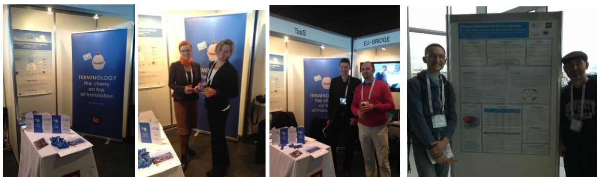
Figure 1b. Example photos of TaaS at business and academic events during Year 2