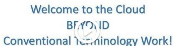
Figure 3. TaaS introductory video

We developed introductory video demonstrating main functionalities of the first public release of open Beta testing and published it on the TaaS platform website and on YouTube (see Figure 3).